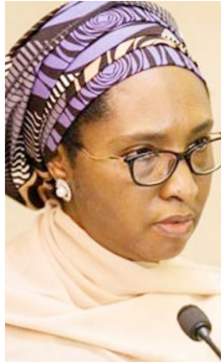
Minister of Finance, Budget and National Planning, Mrs Zainab Ahmed

She noted that the NDIC has for a long time since its establishment in 1988 collaborated with other international standard-setters and deposit insurers. For instance, the NDIC has collaborated in capacity development with the IADI itself, the ARC members, the Financial Stability Institute, the US FDIC, the Islamic Financial Services Board and several