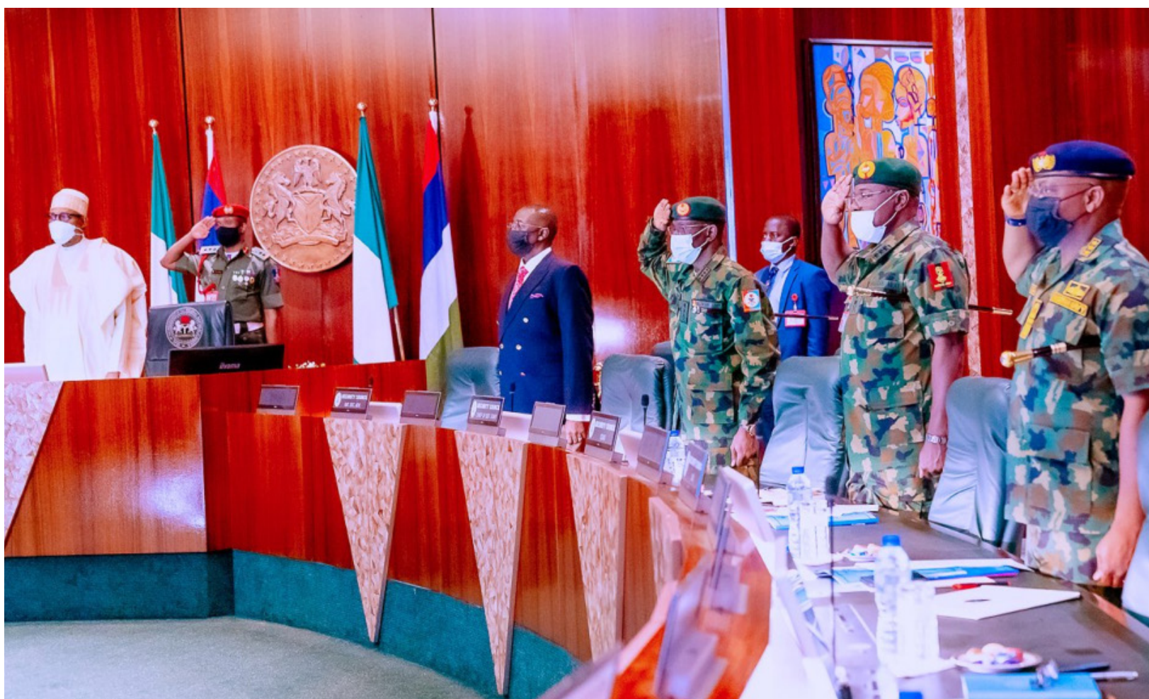
President Muhammadu Buhari presides over security council meeting

Assures that security agencies are putting measures in place to forestall any attack