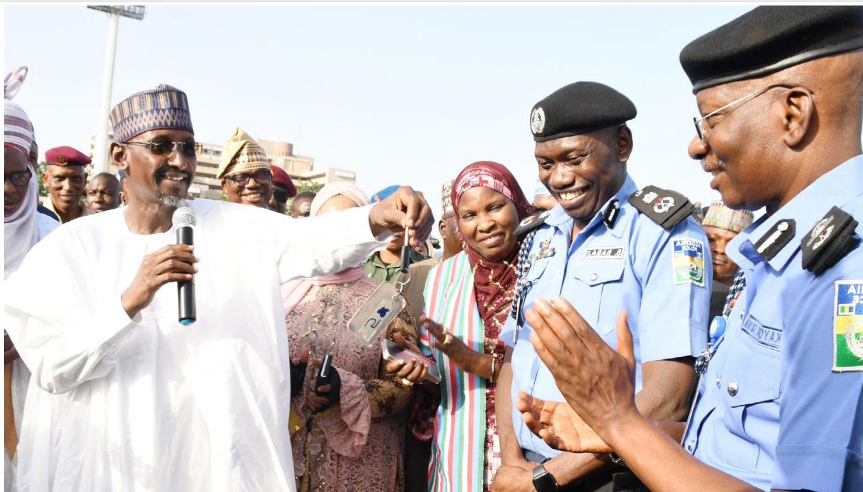
FCT Minister, Malam Muhammad Musa Bello, (r) handing over the keys of newly procured operational vehicles to the FCT Commissioner of Police, Sunday Babaji (2nd l) and AIG Zone 7, Kayode Egbetokun during the handover of 60 operational vehicles to security agencies in the FCT Abuja at the weekend

She said as a vaccine preservative, thimerosal is used in concentrations of 0.003 per cent to 0.01 per cent, (for example, thimerosal content allowed in vaccines is between 30 parts to maximum of 100 parts out of million parts of the vaccine formula). Thimerosal is a mercury-based preservative that has been used for