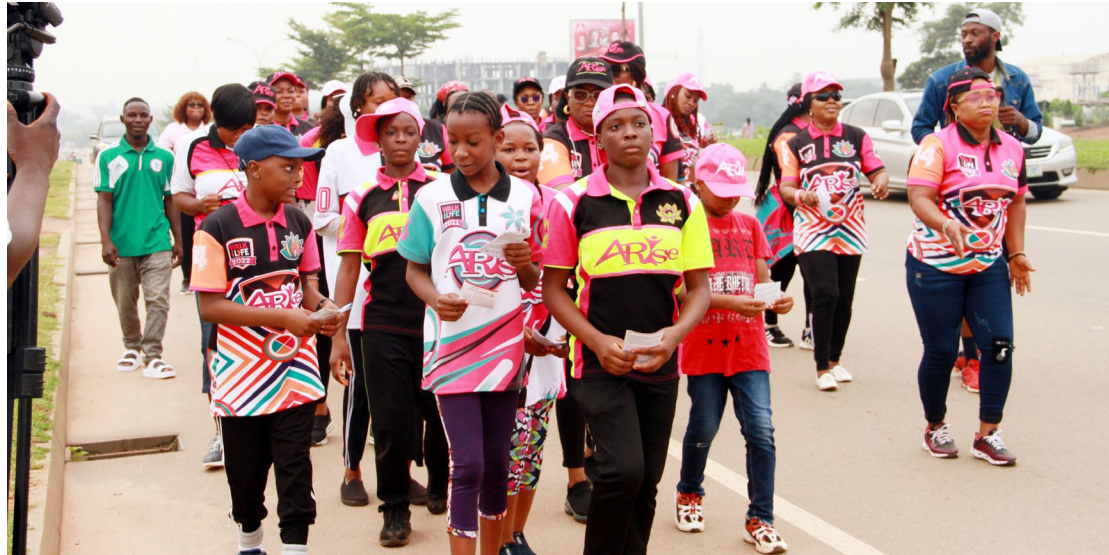
Members of RCCG Jesus House Parish Abuja during the 2022 Arise Walk for Life Road show in Abuja

He said, "The challenges of job security, decent work, health and safety are still very rampant in the Nigeria Oil and Gas industry, which the union is dealing with seriously".