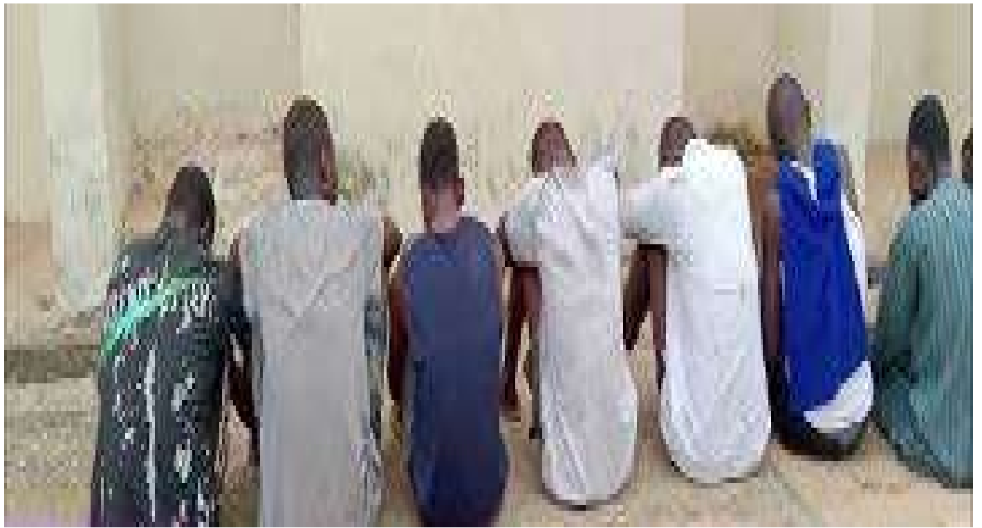
Police parades some suspects in Nasarawa

suspect called his victim on the phone and threatened him. Due to fear of being kidnapped, the victim was coerced into paying the sum of one million, one hundred and fifty thousand naira (N1,150,000) to the suspect as ransom.