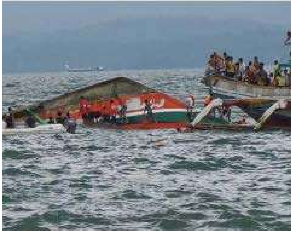
The ill-fated boat inside deep water and divers in desperate effort to rescue

He demonstrated his exceptional passion as a philanthropist and people's ambassador when a boat accident occurred. In the midst of the painful occurrence, he did not wait for authorities. He moved very fast to the scene of the tragedy and was practically involved in helping people in the best way he could.