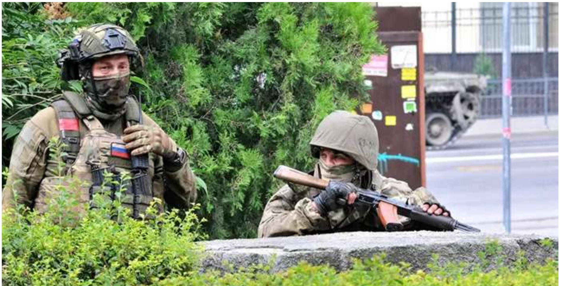
Wagner Group, Yevgeny Prigozhin

"Hence I support Vox because I consider [it] is the only party that can radically change all the left-wing policies that have been approved little by little," she says.