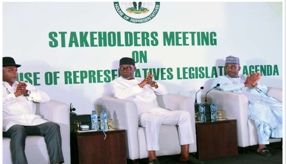
L-R: Minority leader, House of Representatives, Rep. Kingsley Chinda; Majority Leader and Chairman, House of Representatives Ad-hoc Committee on Legislative Agenda, Rep. Julius Ihonvbere; and the Speaker, House of Representatives, Rep. Tajudeen Abbas, during the stakeholders meeting on the 10th House of Representatives Legislative Agenda, in Abuja yesterday.

"The most recent of such efforts, was the one made during the 9th National Assembly which didn't scale through as a result of failure to get the required votes in the Senate for the demand despite succeeding in the House of Representatives," he lamented.